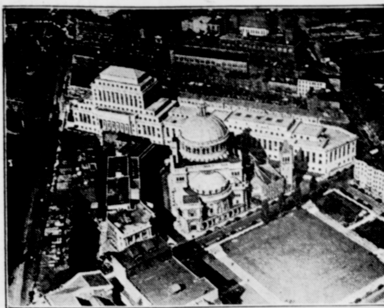
Airplane view of the Christian Science Buildings in Boston, taken by the Staff Photographer of The Christian Science Monitor

Please take notice all Jobs' Daughters and members of the Council, the next meeting will be Sept. 18th—unless notified of a special meeting.