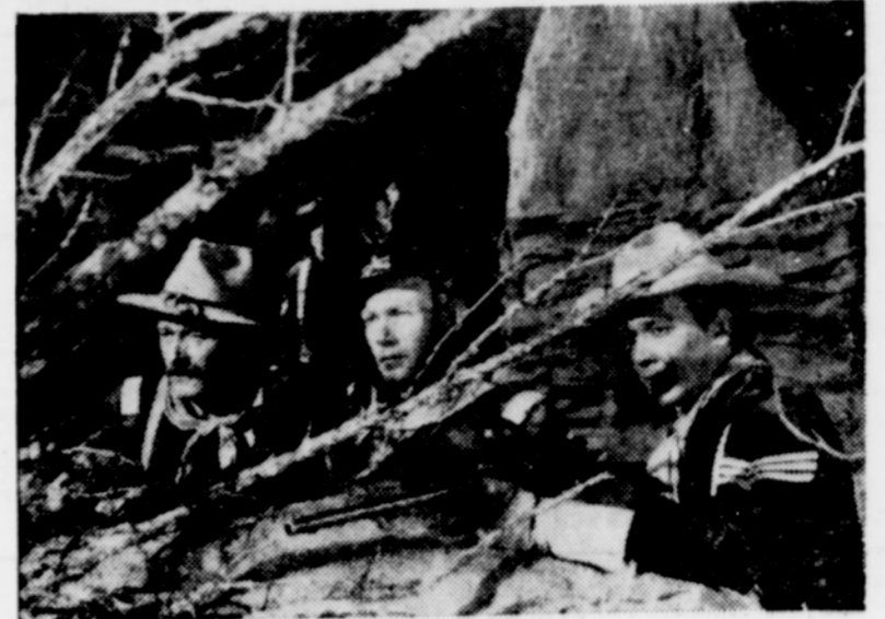
John Wayne, Harry Carey, Jr. and Ben Johnson secretly watch a pack of hostile Indians in this scene from the technicolor production "She Wore A Yellow Ribbon." Joanne Dru and John Agar co-star with the trio.