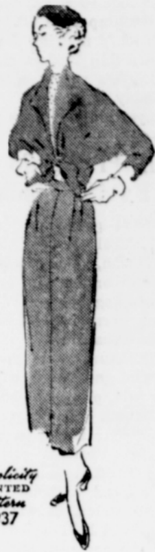
Simplicity PRINTED Patterns 2937