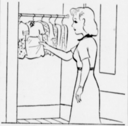
with well styled clothes.

It's discouraging to see children outgrowing clothes so rapidly, and for this reason many mothers like to make clothing a bit on the large side so the youngster can grow into it. There's no better way to start an inferiority complex in the young