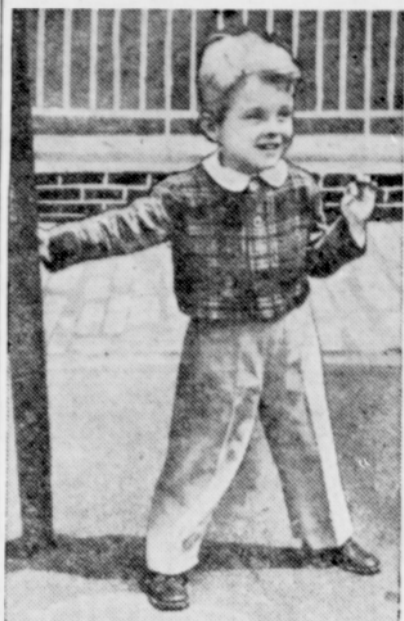
This young gentleman is well dressed for school or play in his smart two-button jacket made of an all-rayon worsted type fabric. The fabric, woven from Avisco yarns, is color-fast and completely washable, and will withstand all sorts of rough and tumble wear. There's a liberal sleeve and seam allowance to let the clothing grow with the boy.

late daddy and big brother as much as possible with good tailoring. Pants are full enough to drape or to have well pressed pleats. Shirts are sewed carefully so they can look tailored and correct in even small details.