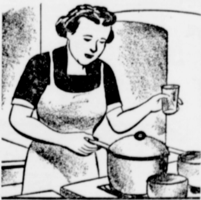
"... I am a good cook . . ."

was dropped and the student was freed. The first thing he did was to file a damage suit against the jailer for tolerating a "kangaroo court" in the prison. The jailer protested he wasn't responsible for how the inmates treated each other, but the court disagreed and held him liable. The judge said that a jailer's duty is not only to confine his prisoners but to protect them, too.