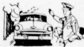
CERTI-SAFE HYDRAULIC BRAKES

No other low-priced car offers you all these EXTRA VALUES