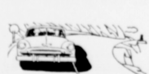
5-INCH WIDE-BASE WHEELS plus LOW-PRESSURE TIRES