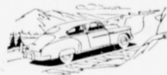
WORLD'S CHAMPION VALVE-IN-HEAD ENGINE