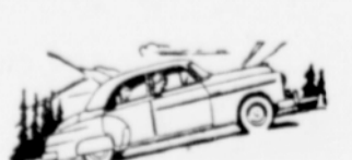
LONGEST, HEAVIEST CAR IN ITS FIELD, with WIDEST TREAD