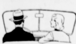
CURVED WINDSHIELD with PANORAMIC VISIBILITY