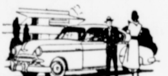
FISHER BODY STYLING AND LUXURY