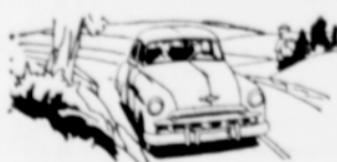
EXTRA ECONOMICAL TO OWN—OPERATE—MAINTAIN