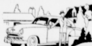
FISHER UNISTEEL BODY CONSTRUCTION