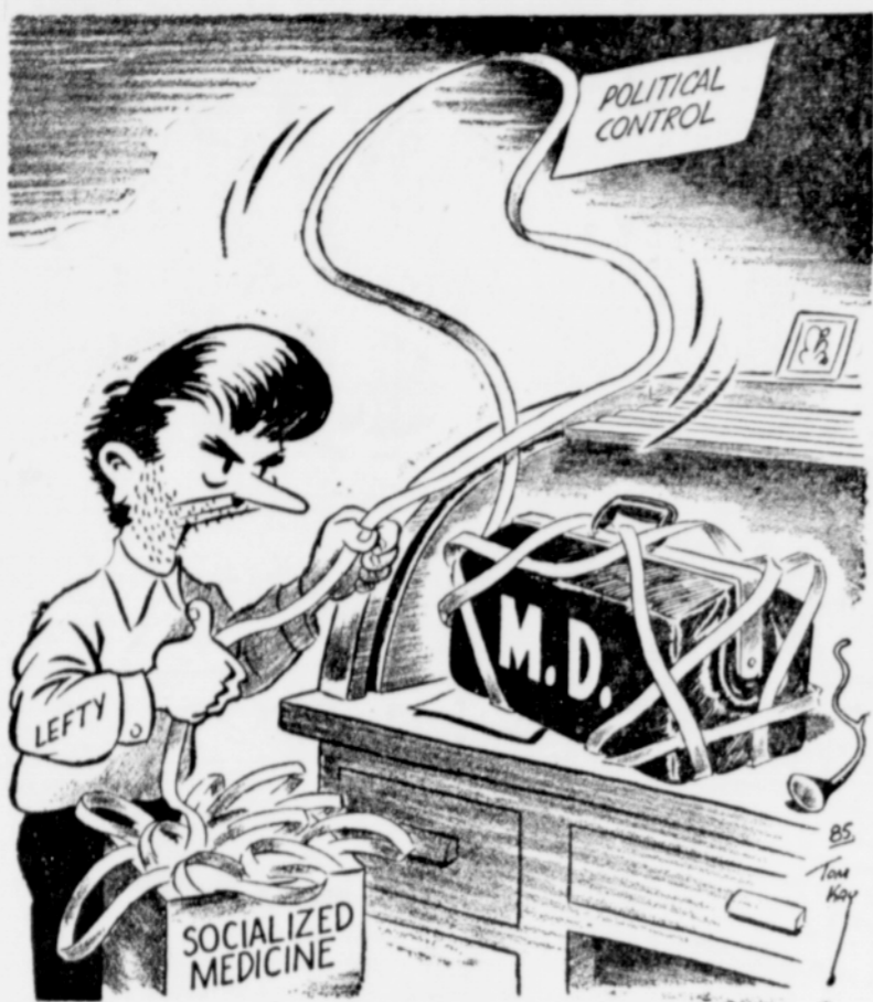
Muzzled Doctors That's what M. D. will stand for if Congress enacts the Free (?) Medicine Bill.