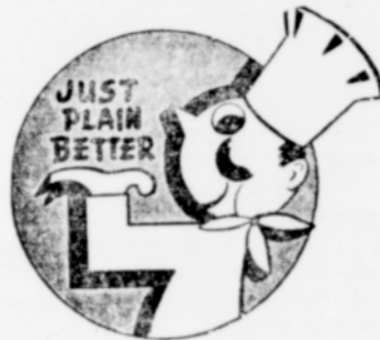
TRACY'S STEAK HOUSE Grants Pass