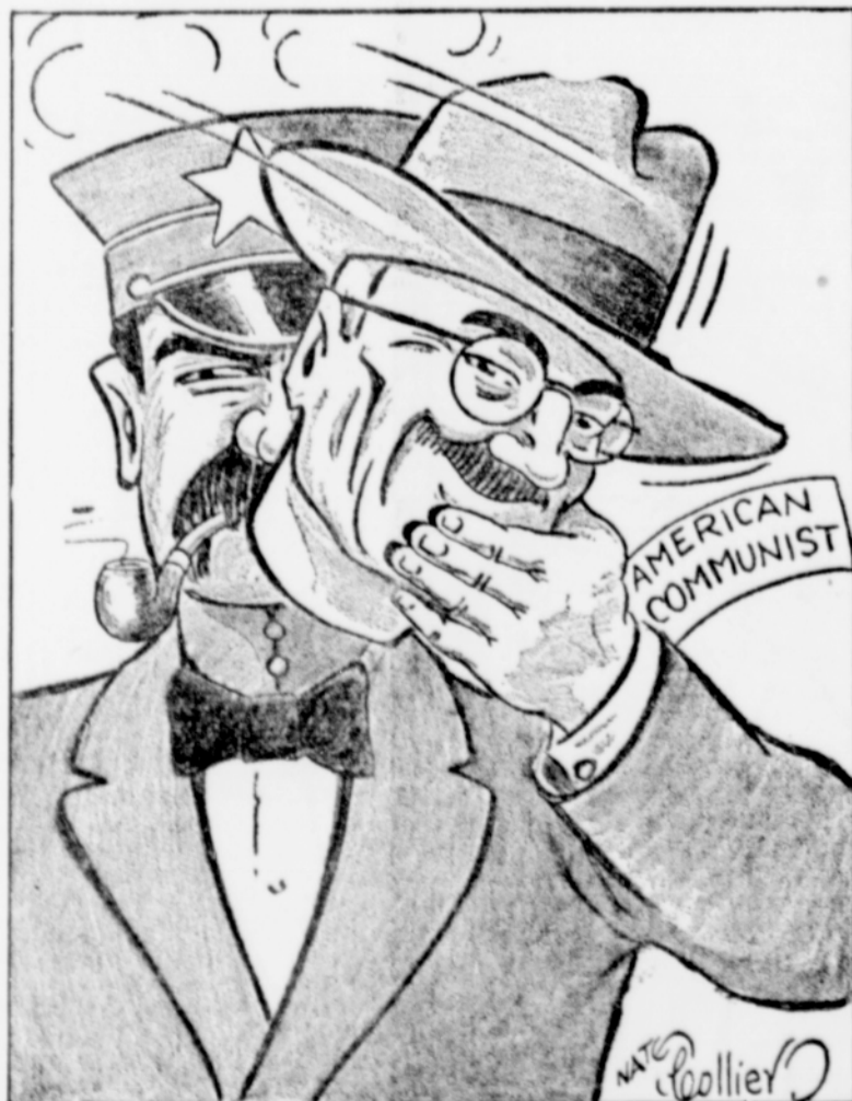
"U. S. Reds Say That They Will Aid Russia In War."—News Headline