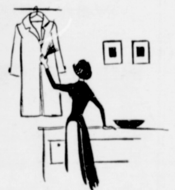
Refresh your woolens.

High-standing, small collars are very popular on princess style