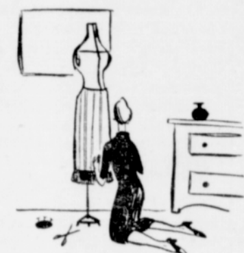
Add fur to skirts . . .

If you've been giving your silk and rayon blouses a quick cleaning, plan to give them more attention in both washing and ironing