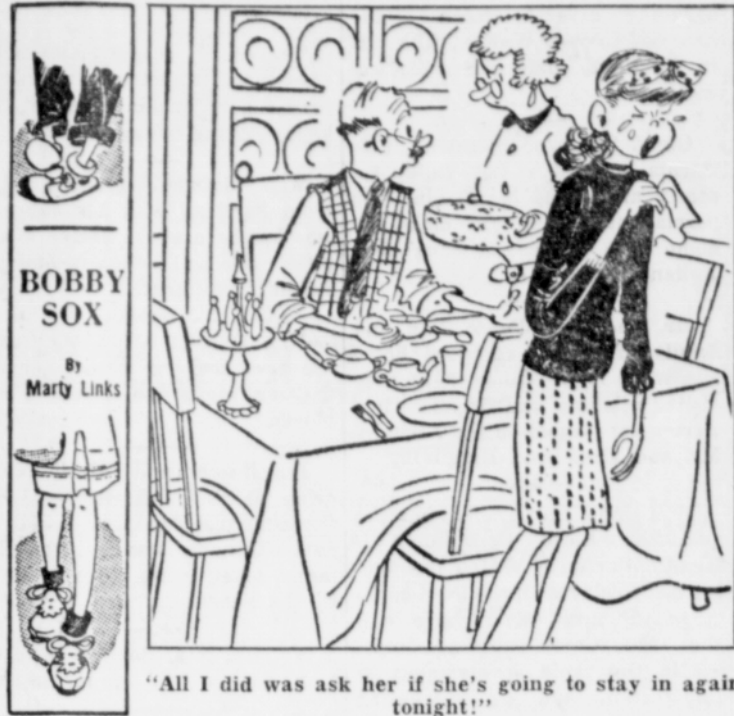
"All I did was ask her if she's going to stay in again tonight!"