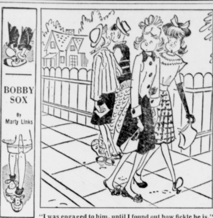
"I was engaged to him, until I found out how fickle he is."