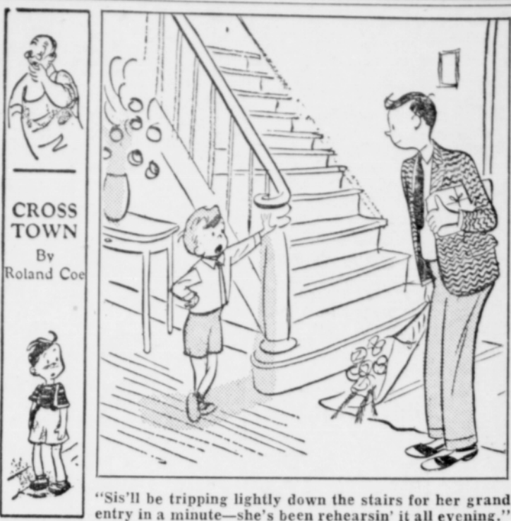
"Sis'll be tripping lightly down the stairs for her grand entry in a minute—she's been rehearsing' it all evening."