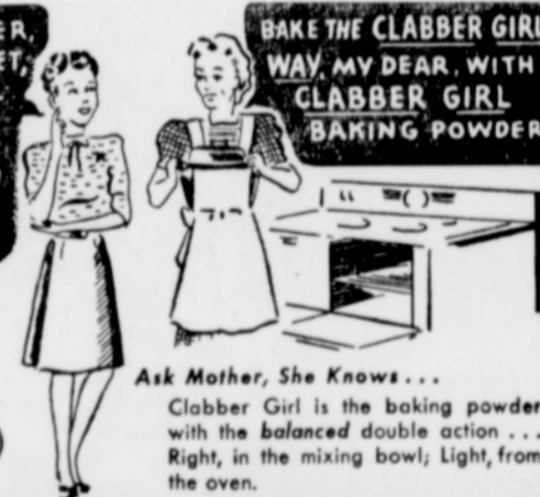
Ask Mother, She Knows . . .

MOTHER, MOTHER, WHAT'S YOUR SECRET, WHAT MAKES ALL YOUR CAKES SO FINE, TELL ME, WON'T YOU, HOW YOU DO IT, SO I CAN BE PROUD OF MINE.