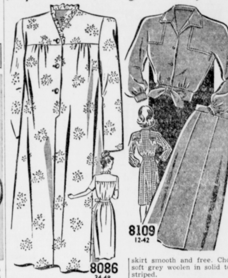
Warm and Comfortable

FOR cold winter nights — this pretty yoked nightdress will be cozy and warm made up in a flower sprinkled flannelette. If you like, it can have short sleeves and be tied with a narrow belt.