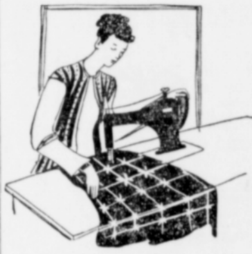
Same your mattresses . . .

Protective measures such as I've just mentioned are absolute essentials in dusty and sooty communi-