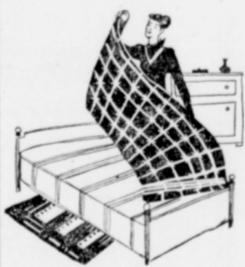
with quilted pads.

Blanket covers do not take the place of a daytime spread, although some are lace trimmed or elaborately monogrammed, but they are nice when the room is used in-