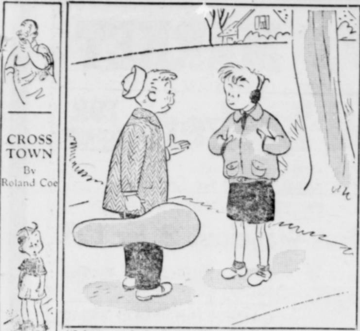
CROSS TOWN By Roland Coe