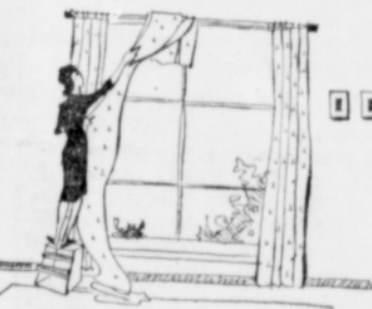
Create new window effects...

If you want to let in a lot of light yet give the impression of the window being draped, hang sheer curtains from top to bottom. Then use an extra pair of sheer curtains and hang them in a drapery pattern