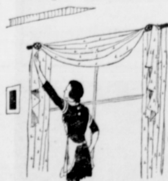
To add tonic to your rooms.

Perhaps you have a desire to convert your bedroom from a thing of frilly ruffles into something more