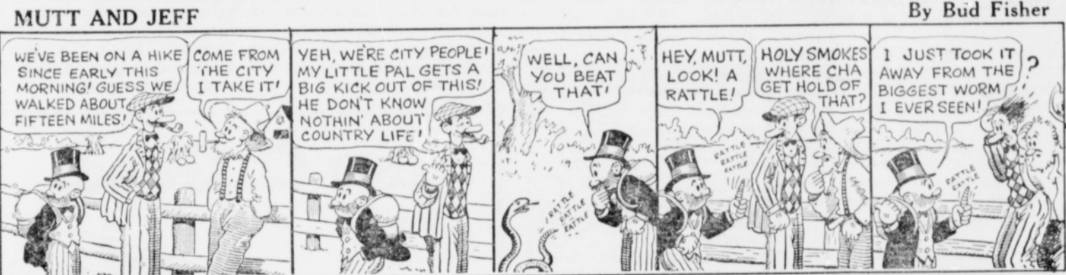
MUTT AND JEFF By Bud Fisher

VERY INTERESTING WHAT'S INTERESTIN'? IT SAYS THAT IF A PERSON TELLS A FIB, HIS FACE REDDENS A BIT WELL, DAT DON'T APPLY TO ME--- --- BECAUSE I NEVER TELL ANY FIBS