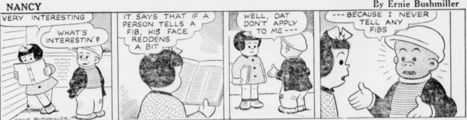
NANCY By Ernie Bushmiller

"Good morning, Ma'am. Your friend, 'the little gem vac,' is back from the wars!"