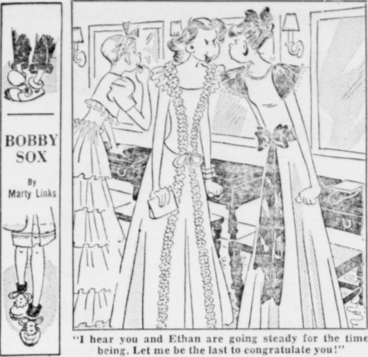
BOBBY SOX By Marty Links

"I hear you and Ethan are going steady for the time being. Let me be the last to congratulate you!"