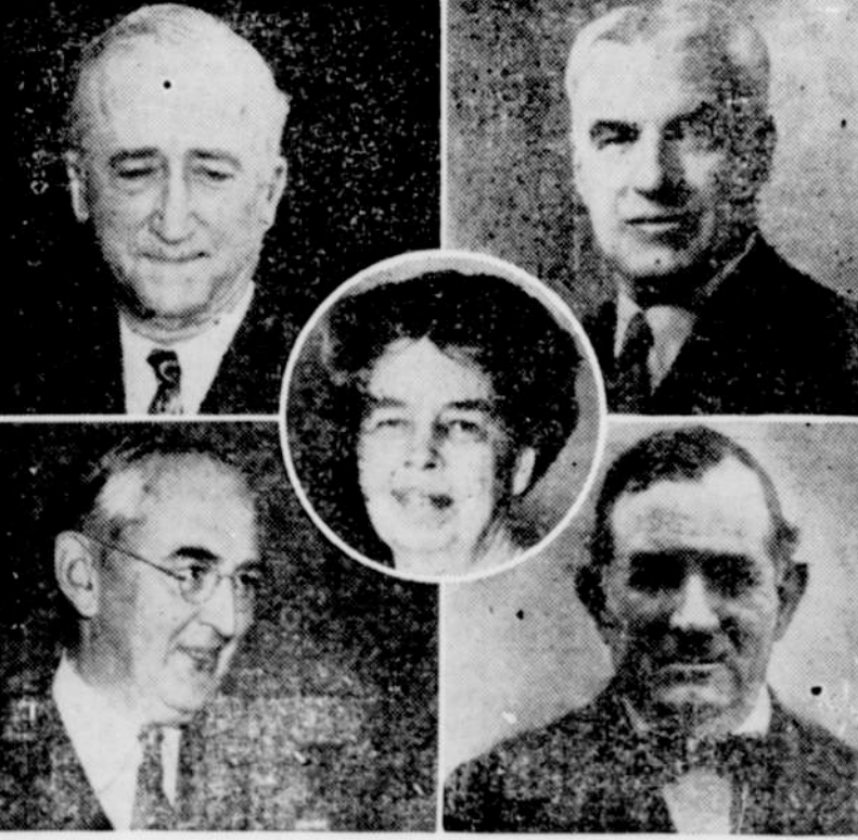
NAMED UNO DELEGATES . . . Secretary of State Byrnes, upper left, will head the U. S. delegates to the general assembly of the United Nations. Edward R. Stettinius Jr., upper right, will head the delegation during the absence of Secretary Byrnes. Senator Connally, lower right, Senator Vandenberg, lower left, and Mrs. Franklin D. Roosevelt were the other members of the delegation chosen by President Truman. Stettinius will also serve as the U. S. representative in the security council with rank of ambassador.