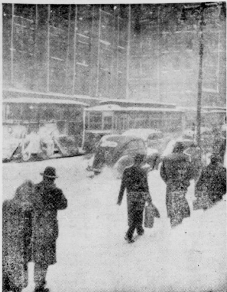
IN THESE UNITED STATES . . . At Miami Beach, Fla., they relax in the shade of palm trees (left), while the temperature soars into the 80s. But it is a different story on New York's Fifth avenue, where old man winter paid a visit. Right, shows Fifth avenue crowd fighting a 12-inch fall of snow which tied up traffic. Buffalo reported four feet of snow, while northern cities announced that they welcomed a white Christmas.