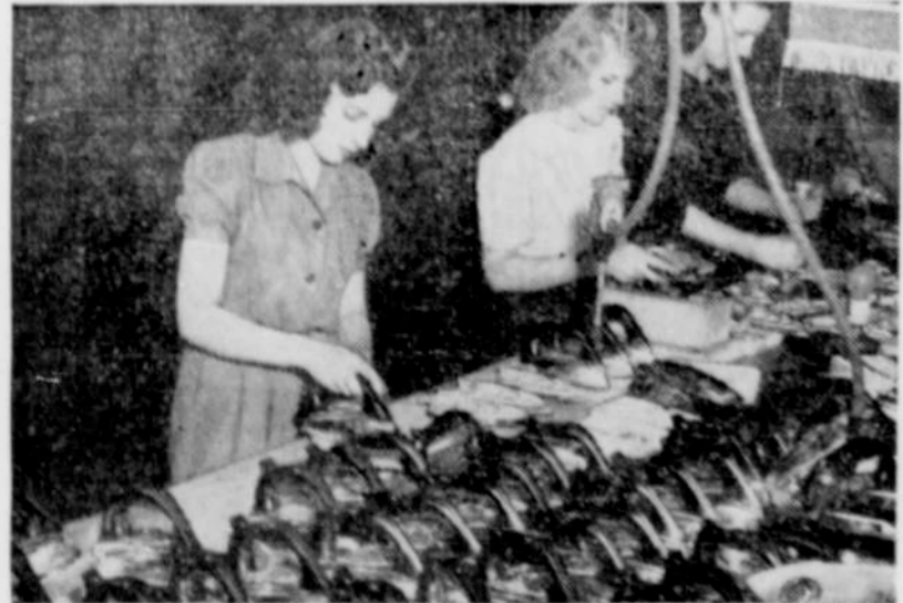
Newest kind of iron, a Eureka company cordless electric, which operates from safety base to which cord is attached, is shown coming off the assembly line. The iron operates from a thermostat-controlled electric safety base from which instant heat is drawn by brief electric contact. A micro-heat regulator in base governs temperature.