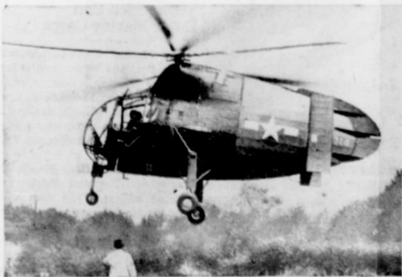
What the helicopter of tomorrow may look like is pictured by this new army model. Seen in flight in Upper Darby, Pa., it looks like a giant bumble bee with its stubby fuselage. The craft is an experimental model and has been undergoing tests since August, 1944. Early tests indicate that it has merits not found in previous models.