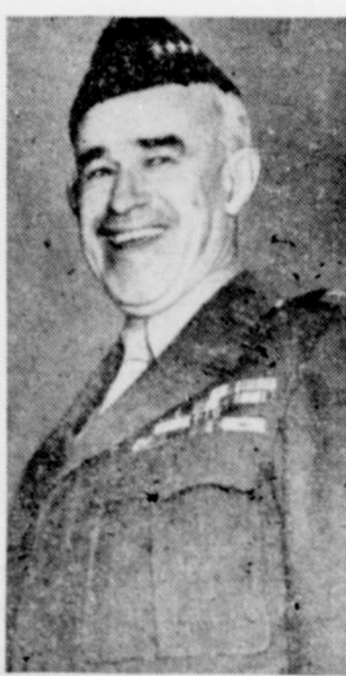
Gen. Omar Bradley appointed head of the veterans' administration. "If I had a son I would like him to go to Bradley or Ike for advice," the late Ernie Pyle once said. Servicemen are backing the choice.