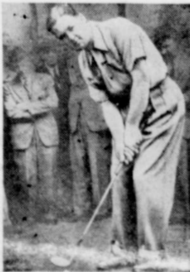
Byron Nelson shown as he won the 72 holes of the $10,000 Canadian Open Golf tourney. He finished 16 strokes better than Jug McSpaden, the second man.