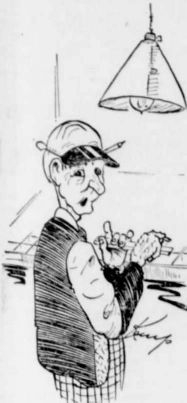
"This next stickful o' type is goin' to say just one thing—We got 35 millions of Japs to beat."