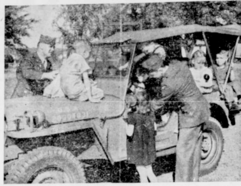
"We're buying one," yelled youngsters at the Whittier School, Sioux Falls, South Dakota, when they saw the jeep above. Actually they expect to have bought enough war stamps and bonds by the middle of December to pay for two jeeps for the armed forces. The army sergeants in the picture motored over from Sioux Falls Air Field to show the boys and girls just what their savings are purchasing.