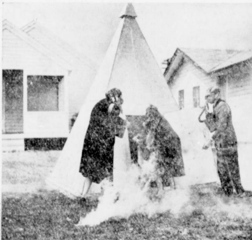
Mass production air raid shelter, shown during a tryout in Boston. It is bolted on a concrete base. Ventilation comes in at the top where the little cone crowns the steel pyramid. Yes, this shelter can accommodate 12 people. With air raid alerts on both coasts, interest in shelters is increasing. Some can be bought for as little as $200.