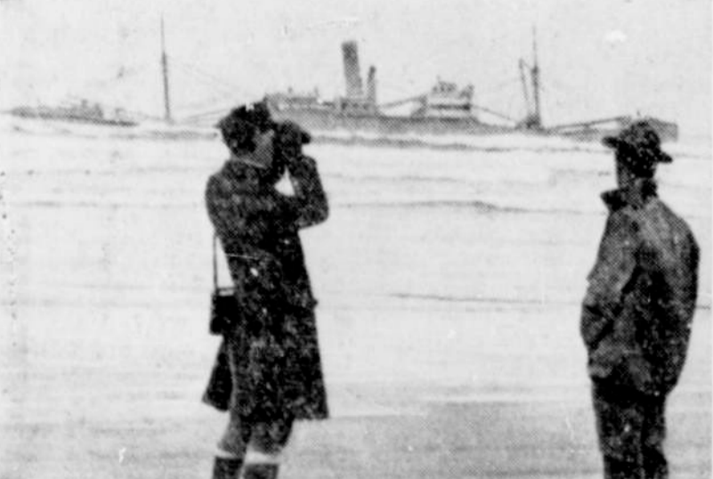
Two members of an army beach patrol are shown looking at the stranded Mason line steamer, Mauna Ala, which ran aground near Astoria, Ore., while en route to Hawaii. The steamer was the first victim of the West coast blackout, having run aground when she lost her bearings because of darkening of lighthouses during an air alert.