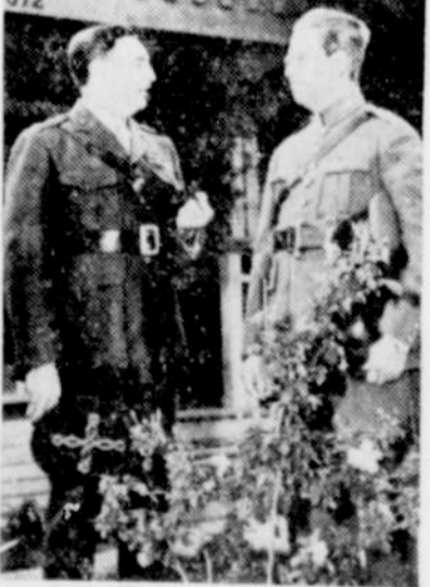
Maj. Gen. Price of the U. S. Marine Corps (left) visits Gen. Contreras, commander of the second military zone of Baja, Lower California, in Tijuana.