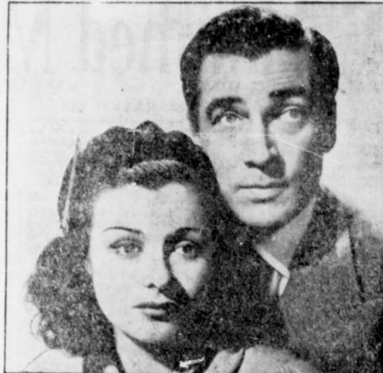
Coming to the Cave City theater Sat. and Sun.