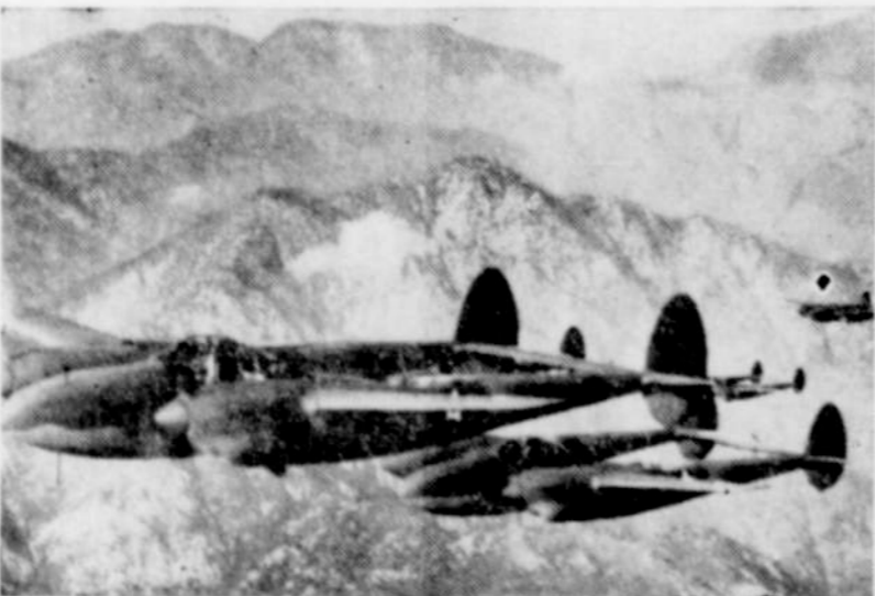
Piloted by U. S. army fliers, these speedy Lockheed Interceptors are in mass delivery flight to air corps headquarters in the East. Pictures, the first ever taken of the "Lightning" in formation, were taken after the planes took off from Burbank, Calif. The P-38 is the only fighter equipped to go into the stratosphere after bombers.