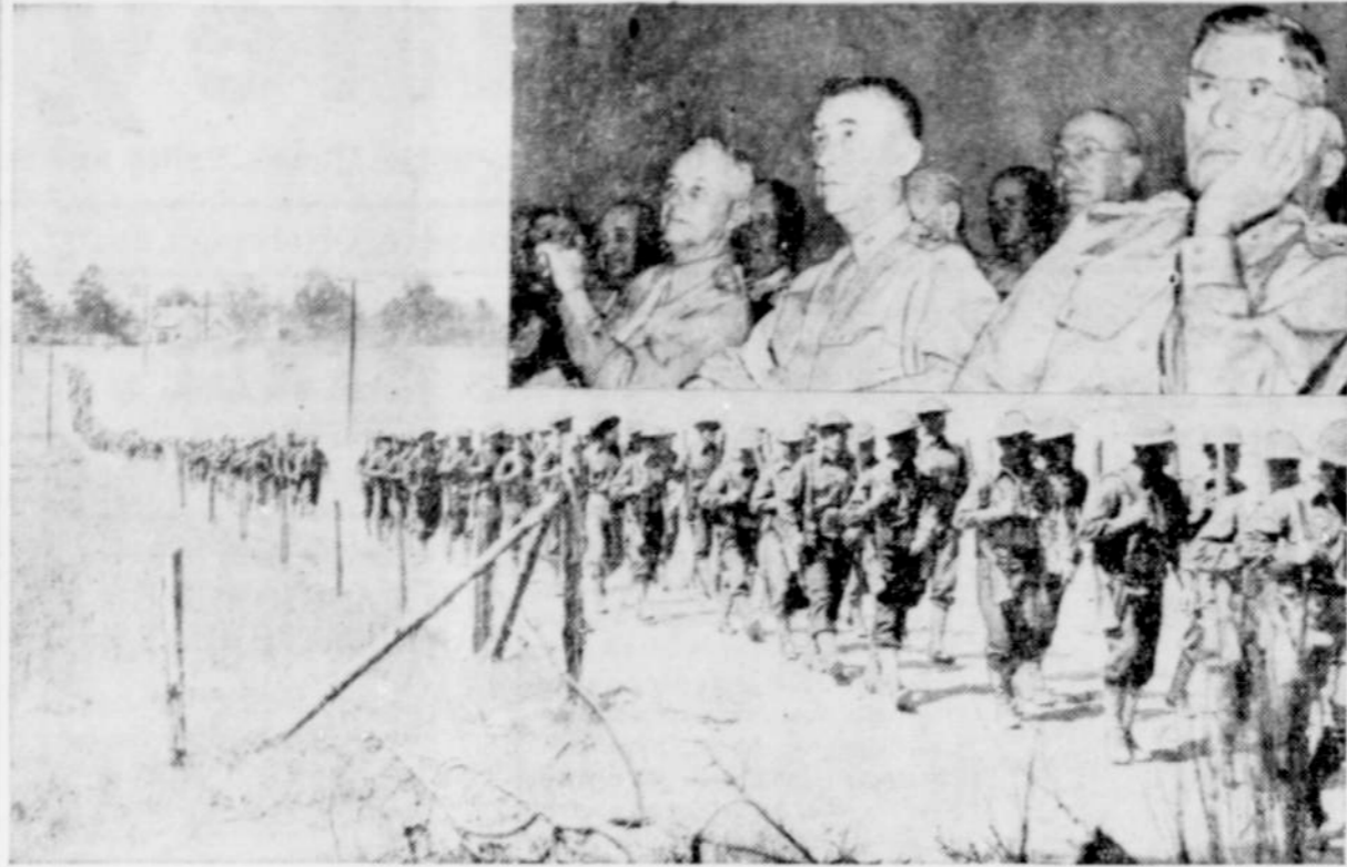
Upper Right: (L. to R.) Lieut. Gen. Delos Emmons, Lieut. Gen. Walter Krueger and Lieut. Gen. Ben Lear, commanders of the two field armies and air force in war games in Louisiana, listen to comments on the games by Lieut. Gen. Lesley McNair, chief of staff at GHQ, Washington, D. C. Below: The infantry battalion has borne the brunt of the battle in the first army maneuvers at Camden, S. C., and returns to camp after the "attack."