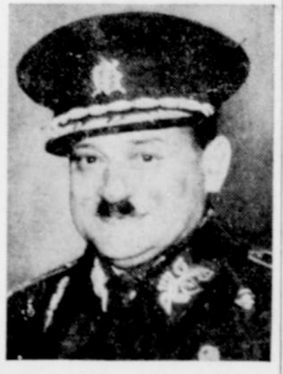
Gen. A. Elias, prime minister of Bohemia and Moravia, whose execution was ordered by the Gestapo on charge of "preparing high treason," as Germany clamped down on most of the protectorate.