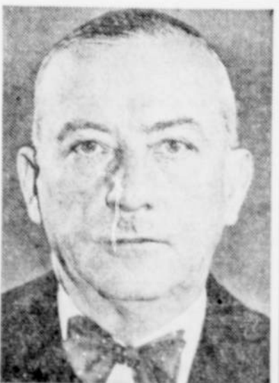
Maj. Gen. John F. O'Ryan of New York, veteran commander of the New York National Guard, who has been appointed senior adviser to Henry Stimson, secretary of war.

Two-Thirds Loaf "How many people work in the government office?" "About one-third of them."