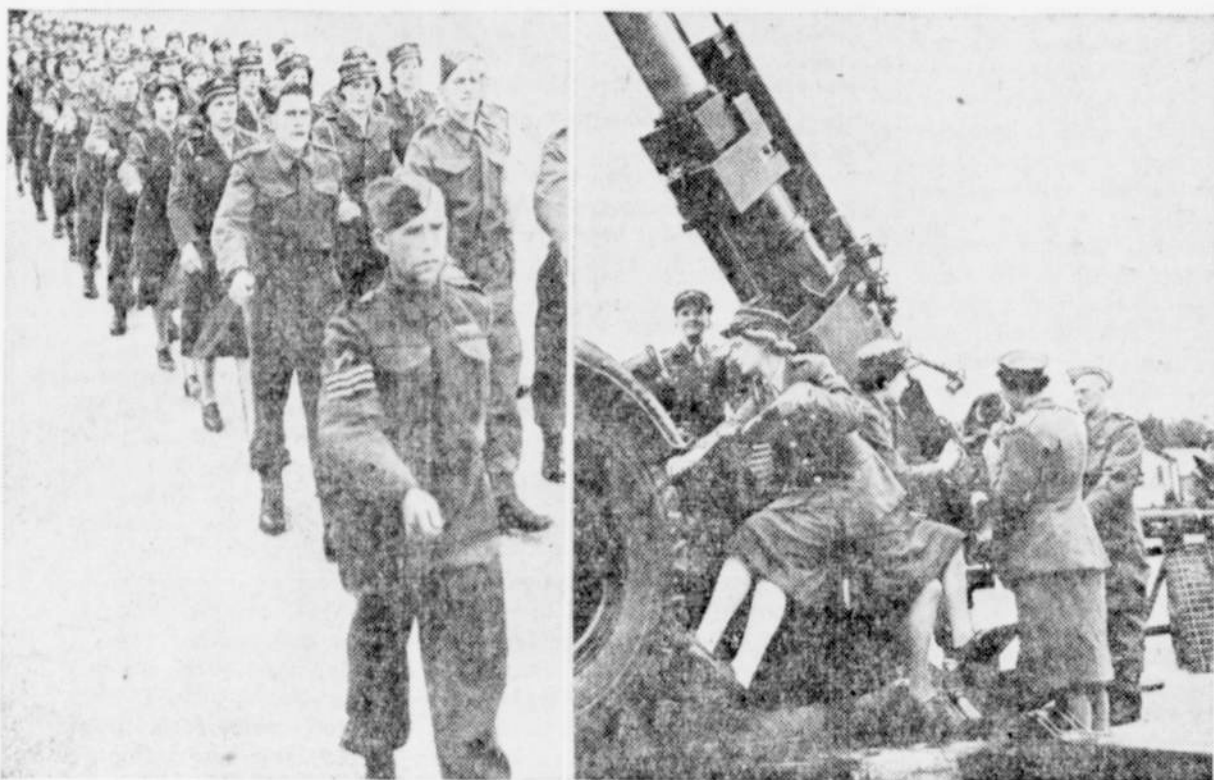
The present World war is an experimental ground for many things that "were never done before." Typical of the never-nevers was the fetish that men and women could not work or fight together in the same regiment. At an artillery practice camp in England these taboos are ousted. Left, we see men and women of the battery parading together, and on the right they are receiving gun instruction together. The test is successful.