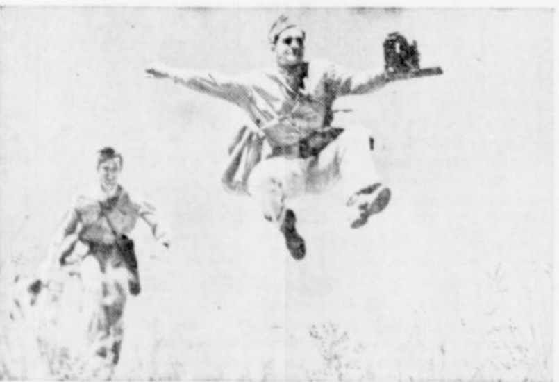
For the first time since the World war, fighting photographers are being trained by the U. S. army. The photographers are taught to crawl up into the front lines and get pictures of real action. Here one of the front lines lens lads at Ft. Benning, Ga., leaps a trench, camera in hand. Behind him comes his assistant with film and other equipment.