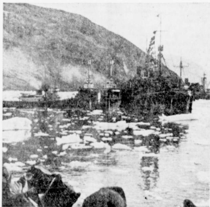
A scene at the American base in Greenland, showing two patrol ships tied to an oil tanker, with a coast guard tug beside them. In far background is a U. S. army transport, while in the foreground can be seen soldiers aboard the transport from which this was taken. This picture is from the first shipment of photos of the American forces in Greenland.