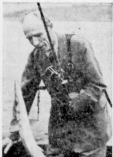
Lord Halifax, British ambassador, took time out for a day's deep-sea fishing while on tour of the U. S. He caught a 22-pound yellowtail, and this barracuda.