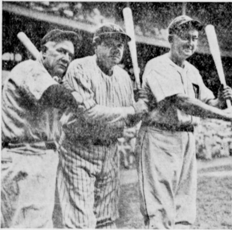
Three of the greatest outfielders of all time get together in Cleveland at an amateur day celebration—Tris Speaker, Babe Ruth and Ty Cobb (L. to R.). Speaker is the former center fielder of the Cleveland Indians. Ruth is the great Yankee home-run hitter of old, and Cobb the former Detroit Tiger star who holds so many records.