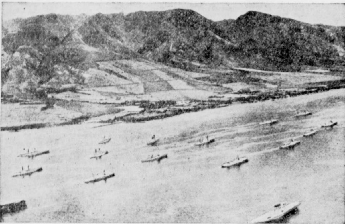
View of the U. S. fleet in Hawaii, our "Gibraltar of the Pacific," which was reported to have sailed under sealed orders. Coincident with this report, President Roosevelt ordered all Philippine armed forces into the selective service of the United States. The move followed the freezing of Japanese credits in the United States and Great Britain.