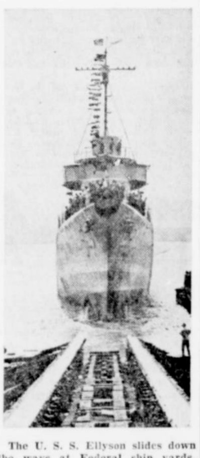
The U. S. S. Ellyson slides down the ways at Federal ship yards, Kearny, N. J. It took the water a short time after the U. S. S. Bristol, which was first out in the twin launching. Both ships were built in record time.