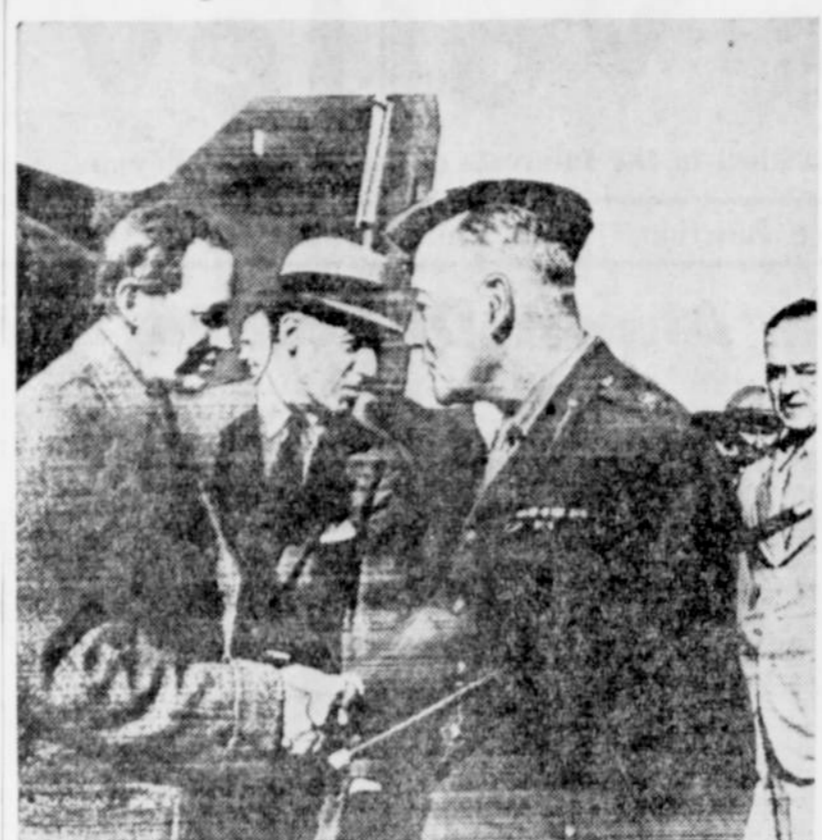
Harry Hopkins, President Roosevelt's personal representative, is shown (left) being greeted on his arrival in the Soviet capital after a secret airplane flight from Britain. Shaking hands with Hopkins is Lieutenant General MacFarlane, head of the British military mission to Moscow. Between the two men is Laurence Steinhardt, U. S. ambassador to Moscow, and (right) Sir Stafford Cripps, British ambassador to Moscow.