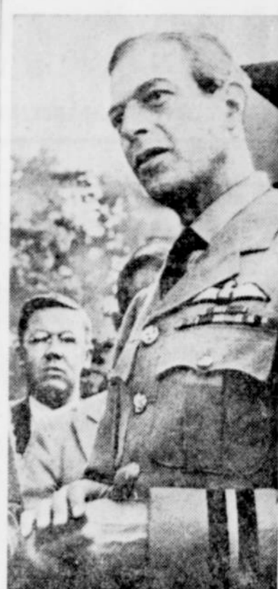
The duke of Kent, brother of King George, being interviewed at Ottawa shortly after his arrival from England. The duke flew to Canada on a bombing plane that brought back bomber ferry pilots. He will tour Canadian training camps.