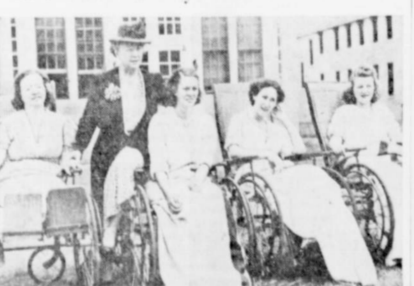
Their ship torpedoed about 400 miles off Greenland while en route to Britain, four Red Cross nurses (shown seated) were landed at Norfolk, Va., after spending 12 days adrift in an open boat in the North Atlantic. Picked up by an American destroyer, they were taken to Iceland for treatment before being returned to the States.