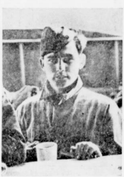
The first photo to come out of Iceland of an American marine of the occupation force shows a "leatherneck" (above) at a counter of a Y.M.C.A. tea car in Reykjavik.