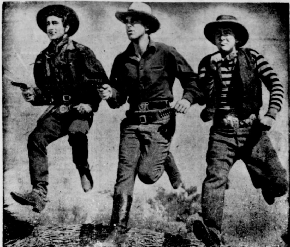
"Rangers of Fortune" revives the old Texas Frontier days in spectacular drama of three freebooting cowboys, at the Cave City Theater Saturday and Sunday, February 15 and 16.