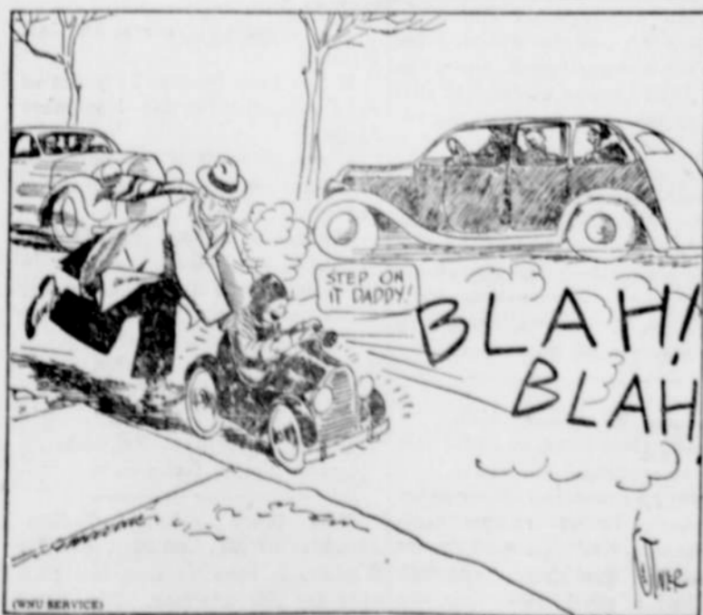
Along the Concrete

Do you own, for your very self, the beauty of the blue heavens, the fleecy clouds and warm sunshine? Do you own the fragrance of the flowers and the song of the birds?