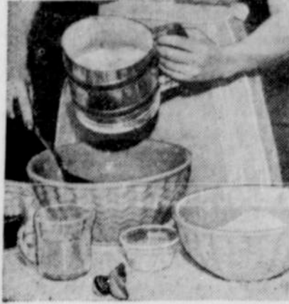
Put sugar, butter, salt in bowl. Add milk. Stir. Cool. When lukewarm add yeast and use egg. Beat. Sift together flour, cinnamon, nutmeg and add to liquid. Mix. Stir in currants.

The ingredients: \frac{1}{4} cup sugar; 2 tablespoons butter; \frac{1}{2} teaspoon salt; 1 cup scalded milk; 1 yeast cake softened in \frac{1}{4} cup of lukewarm water; 2 eggs; 4 cups flour; \frac{1}{2} teaspoon of cinnamon; \frac{1}{4} teaspoon of nutmeg; \frac{1}{2} cup of currants.