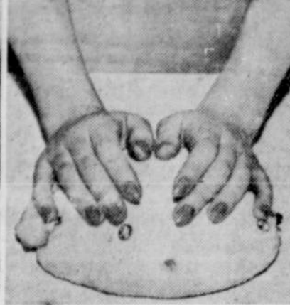
Place in greased bowl, cover, and let rise until double in bulk. Turn dough onto lightly floured board, shape into ball and knead until smooth and elastic. This requires about five minutes.