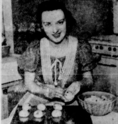
Flour hands lightly, and shape dough into small balls, about the size of a large walnut. Then place them on a greased baking sheet and let them rise in a warm place until they are about double in bulk.