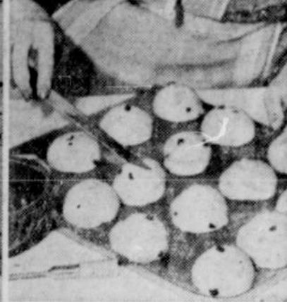
Brush rolls with remaining eggs well beaten. With sharp knife, cut cross in top of each bun. Then let buns rise until light. Bake in moderately hot oven (about 400 degrees) for 15 to 20 minutes.