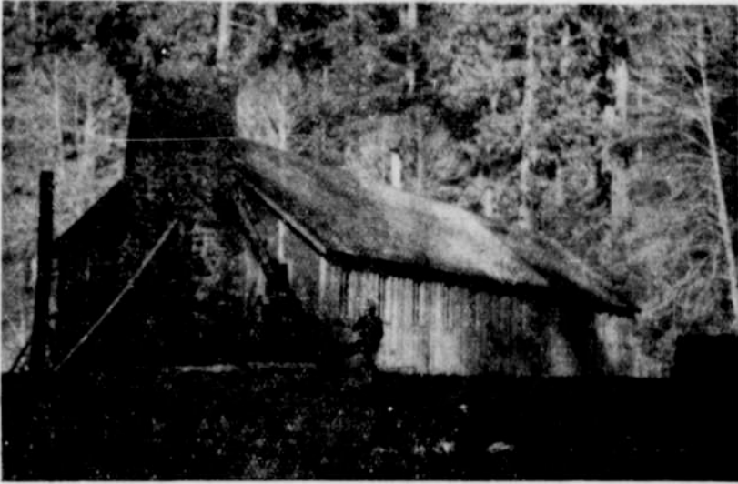
Newly Constructed Woodworking Building at Oregon Caves CCC

While there are now only 103 men in the camp, about 100 new replacements are expected from the east within two weeks. After the completion of improvements in the Caves area and other work projects in this section, the main body of the company will be moved to Crater Lake National park, leaving a spike camp of 35 men here during the summer.