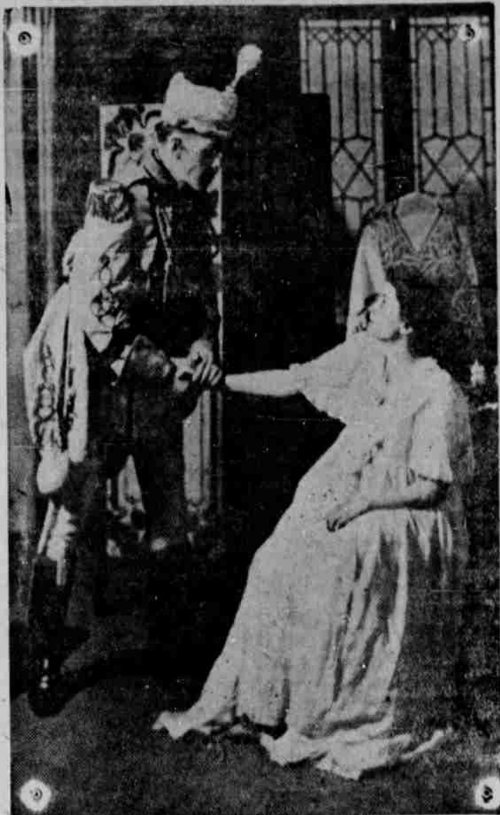
"GRENFELL LORRY" AND "PRINCESS YETIVE" IN McCUTCHEON'S GREAT ROMANTIC PLAY, "GRAUSTARK."

cast and produced the play, has given the same attention to ensemble and detail which contributed so largely to the success of "Quo Vadis," "When Johnny Comes Marching Home," and Mme. Schumann-