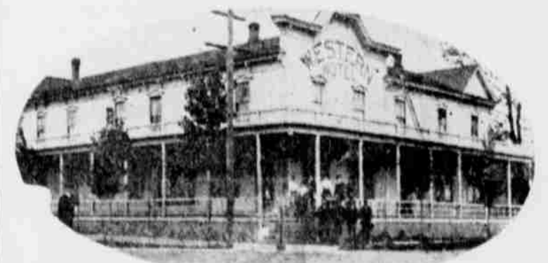
A Home Hotel in All Its Appointments

Should you stop over at Grants Pass go direct to the Western Hotel. Good rooms and good table service