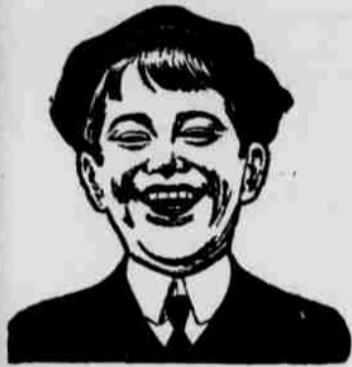
"This would make anybody smile."

Holiday prices on Nuts and Candies. Nuts much lower in price over last season.