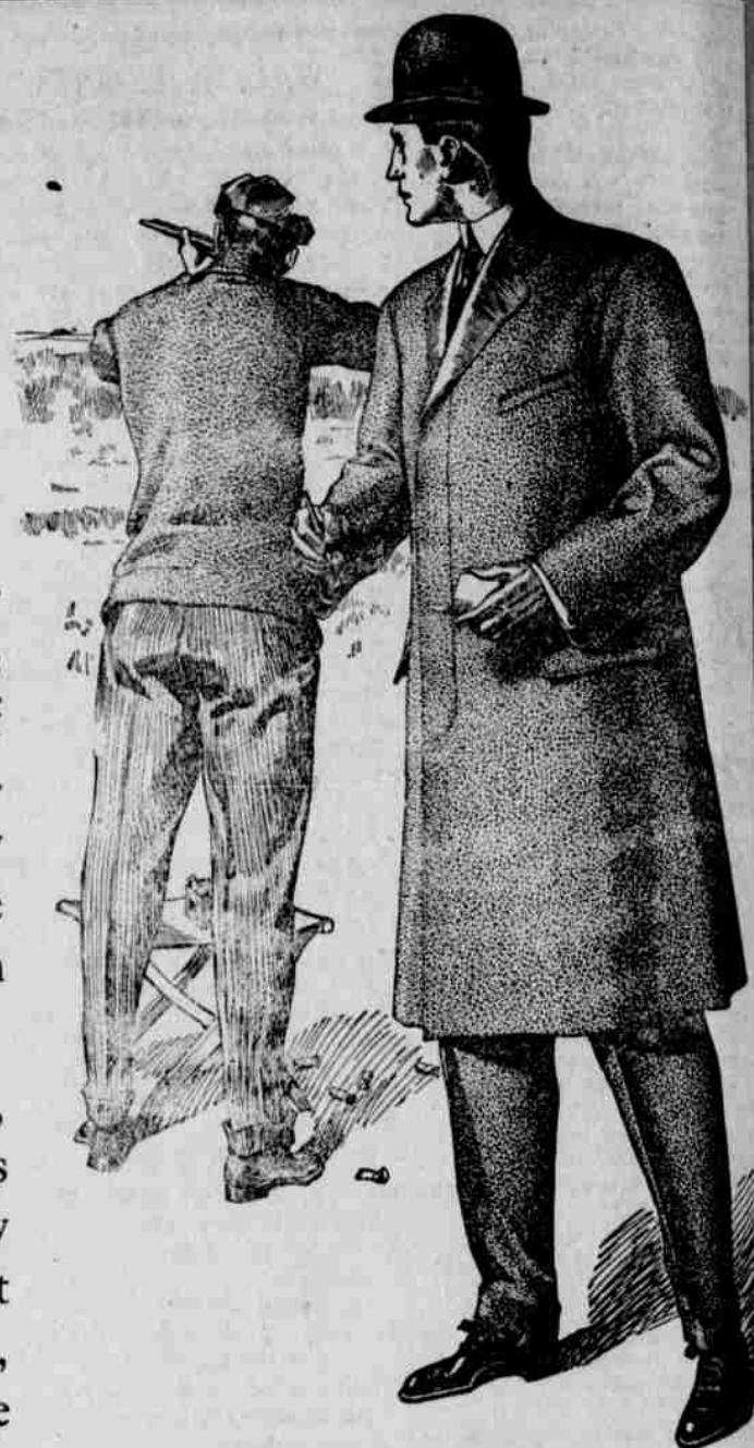
Copyright 1908 by Hart Schaffner & Marx

If you want Shirts, Ties, Hose or Hats in any of the new smart styles; or a suit for business or dress, we'll show you the right things.