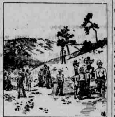
CONVICTS AS ROAD WORKERS.

Along the east coast of Florida there are inexhaustible quarries of cochina rock, while in the district lying south of Daytona to New Smyrna great quantities of oyster shells are to be found. Both furnish excellent materials for road building. Thus Florida has close at hand an abundant and cheap supply of road material. The cochina rock is soft and easily quarried. It requires but simple machinery to crush it, some of it being merely granulated beneath rollers after it is placed on the surface of the road. The beautiful baths at Palm