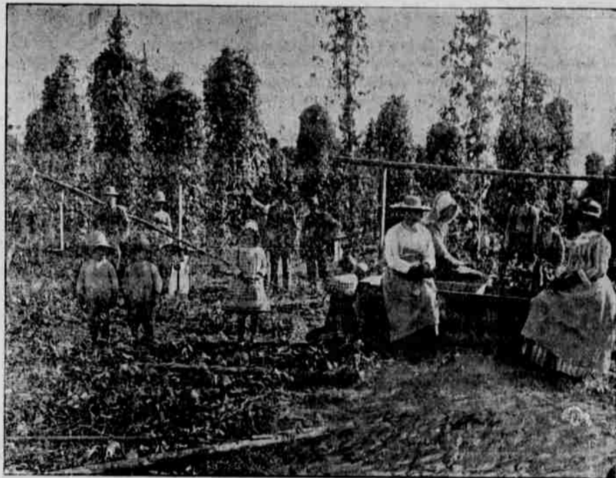
PICKING HOPS IN JOSEPHINE COUNTY.