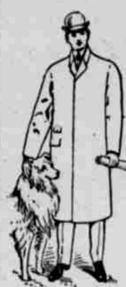
I & S B