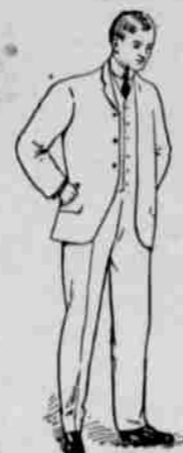
I & S B