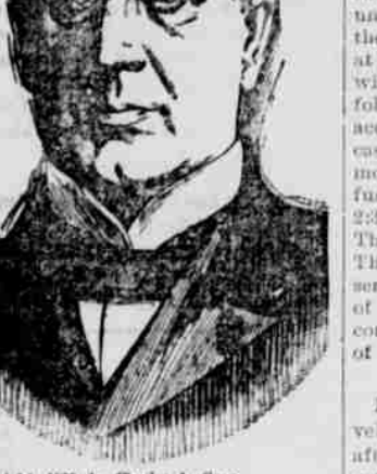
PRESIDENT M'KINLEY.