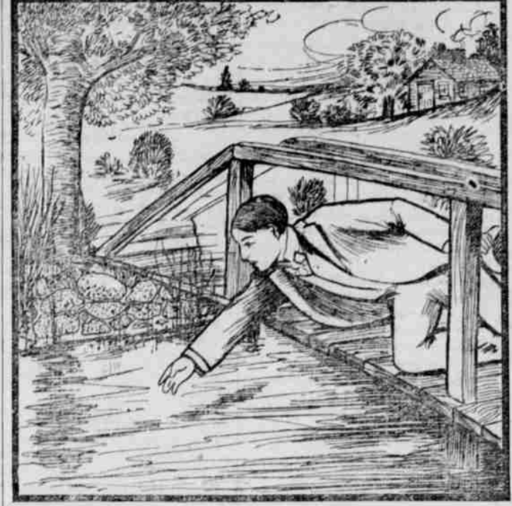
WHERE IS THE TURTLE?

the sense to leave a few hundred dolars in the bank, and when the folks that held the mortgages shut down on him, his doctor took a room for him in a cheap lodgin' house and had him move into it. Seemed quite a come-down, but nobody pitied him