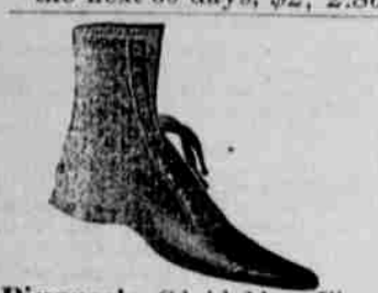
Pingree's Child's Fine Dress shoe $1.25, 1.50, 1.75 At special discount during