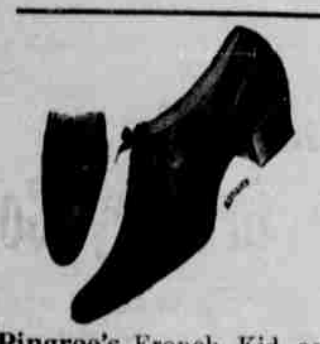
Pingree's French Kid and Calf, Black and Tan Shoes -$2.50 and $3.50 At special discount during the next 30 days, $2, 2.80