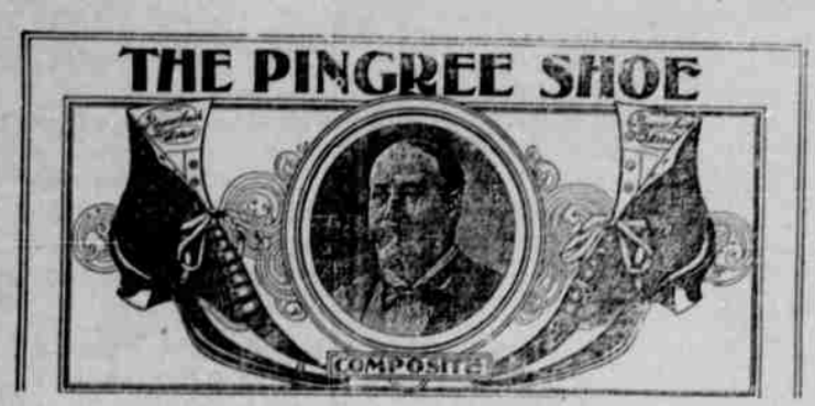
French Kid, Pat. Enamel and Box Calf Fine Hand Turns and Welt, Golf and Walking Boots. At special discount during the next 30 days. $3.00 Composite for $2.40 $3.50 Gloria for $2.80.