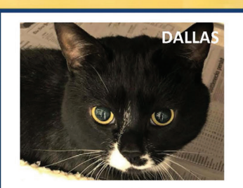
TARRY Dallas is a med. adult male

Clatsop Animal Assistance www.dogsncats.org 503 861-0737