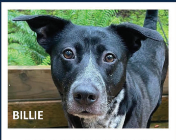
LAB & BLUE HEELER MIX Billie is a med. adult female

Bank of the Pacific Now Open in Warrenton