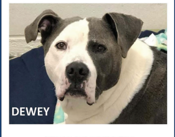
PIT BULL TERRIER Dewey is a large, senior male

Seaside Attorneys 842 Broadway St., Seaside 503 738-6380 www.seasideattorneys.com