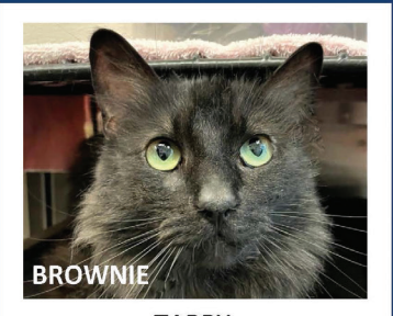
TABBY Brownie is a med. senior female

There are thousands of cats and dogs in rescue shelters. Please consider giving one of them a new chance at life.