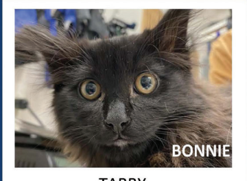
TABBY Bonnie is a med. female kitten

Warrenton Fiber 389 NW 13th St. 503 861-3305