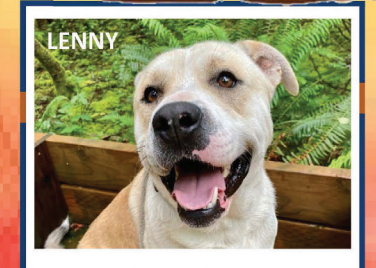
LAB & PIT BULL MIX Lenny is a med. young male

Hammond Kennels 636 King Salmon, Hammond 503 861-1601