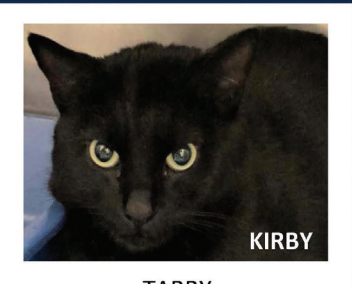
TABBY Kirby is a med. adult male

Meagan Lewis Area Properties 1490 Commercial St., Astoria 503 440- 0155