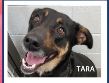
SHEPHERD & LAB MIX Tara is a med. senior female

Bayshore Animal Hospital 325 SE Martin, Warrenton 503 861-1621