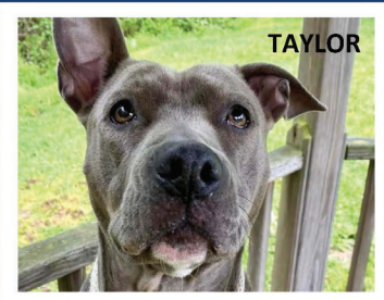
PIT BULL & HOUND Taylor is a med. adult female

Bay Breeze Boarding and Grooming 1480 SE 9th, Warrenton 503 861-9817