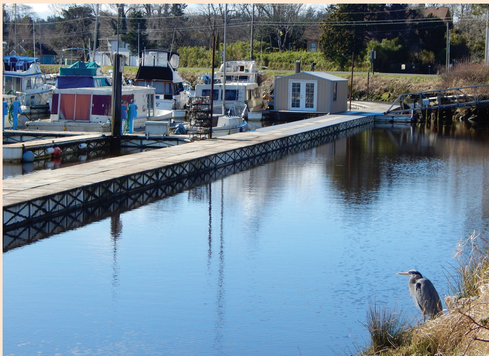
A great blue heron surveys Skipanon Marina from a perch on the embankment.