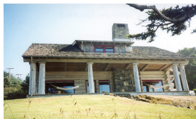
The Oswald West house

The maps are available through the history center's website, cbhistory.org . Click on the link for the cottage tour.