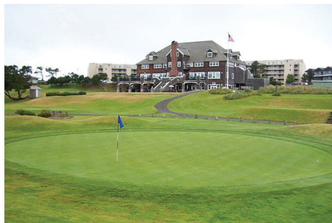
Gearhart Golf Links was one of two courses in Oregon to make Golf Magazine’s top sites under $150 list.