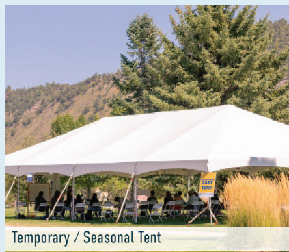
Temporary / Seasonal Tent