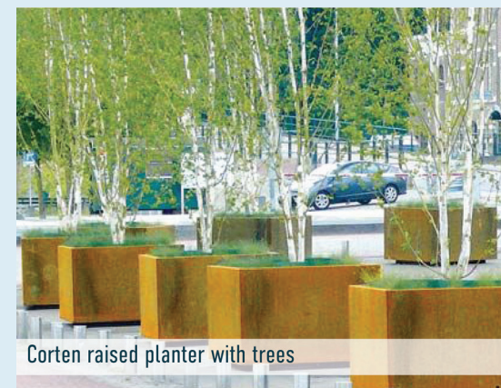
Corten raised planter with trees