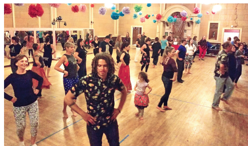
Members participate in a Bollywood-style performance at Astoria Arts and Movement Center.