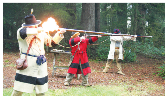
Re-enactors shoot muskets as if they were members of the Lewis and Clark party hunting food.