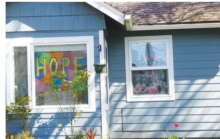
Street-facing windows in a South Main Avenue house.

See related story about scholarships on page 8