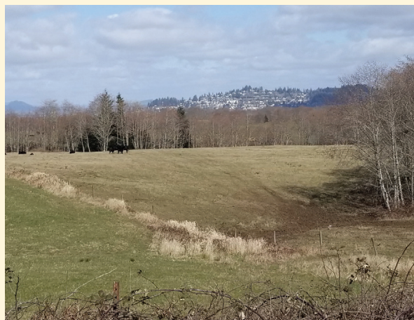
Cows graze in a field just outside Warrenton city limits, one of many areas that could eventually become residential or commercial.