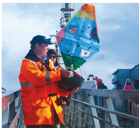
Above: The crowd listens while an engineer from Pacific Power talks about the miniboat program.