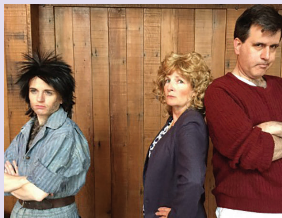
A scene from 'Henceforward.'