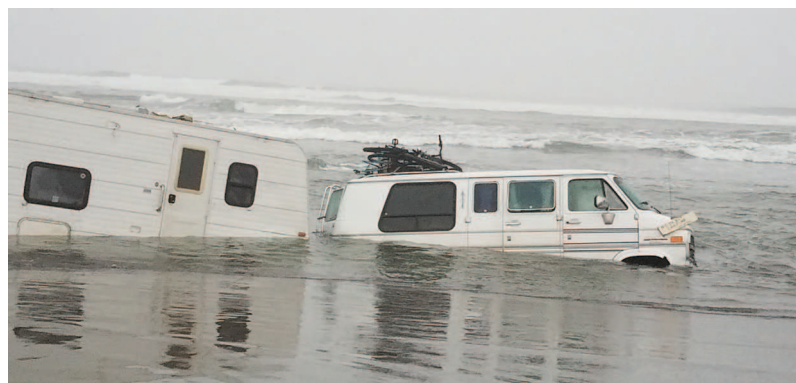
A van and trailer get stuck in the Sunset Beach surf in August.

A drunken driver crashes into the back of El Compadre Restaurant on Main Avenue.